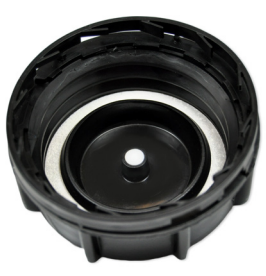
Press-Fit plug cap